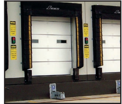
▲ Serco Vertical Dock Levelers do not compromise the energy efficiency of the insulated doors because they're installed inside the facility.