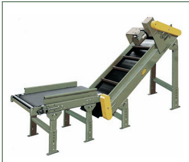
FEEDER SHOWN WITH STANDARD PC TYPE GUARD RAIL, GRAVITY BRACKET WITH POP-OUT ROLLER AND OPTIONAL MS TYPE FLOOR SUPPORTS

CAPACITY —300 lbs. total distributed load at 65 FPM.